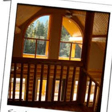
Spacious Loft bedroom