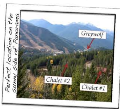
Perfect location on the sunny side of Panorama

Property Size: 52.7308 Acres • Legal Description: DL 4617, Lot B, LD 26 Age: Built in 2003 • Construction: Cedar Log • Foundation: 8' Blue Maxx Wall System Exterior: Log • Roof: Tile • Flooring: Tile & Hardwood • Taxes: To be determined Size: 780 sq ft main floor, 400 sq ft loft, 780 sq ft walk-out basement • Bedrooms: 2 + Loft Bathrooms: 1 Full Bath plus Jacuzzi on main; 1 Full Bath in basement • Sewer: Septic Water: Well • Heating System: Outside Central Boiler - Wood Furnace supplies hydronic heating for Chalets Heating: Basement - Radiant • Power: BC Hydro Back-Up Power: 40 kW Katolight/John Deere - Diesel Generator • Inclusions: Dishwasher, Microwave, Fridge, Stove, Satellite Dish, TV-VCR, DVD, Built-in Vacuum, Window Coverings, Propane Barbeque Chalets are fully furnished & completely self-contained