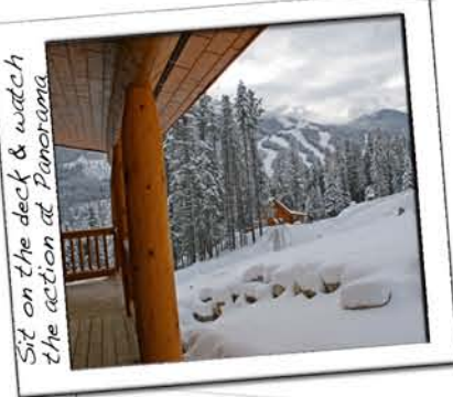
Sit on the deck & watch the action at Panorama