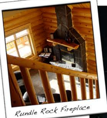
Rundle Rock Fireplace