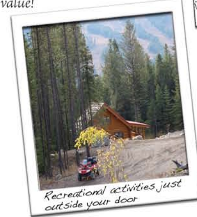
Recreational activities just outside your door