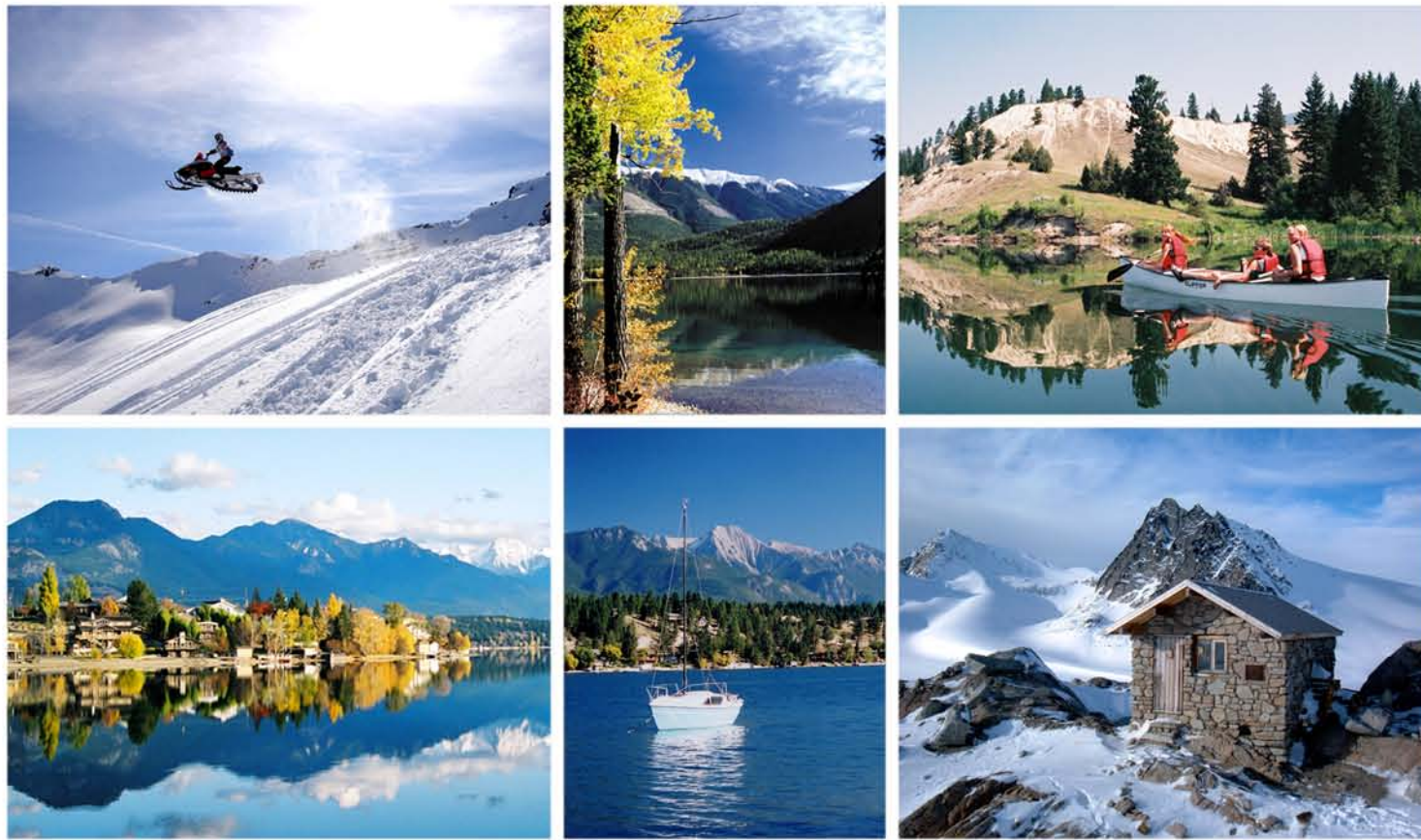
Top: Valley of the Lakes; Whiteswan Lake; Columbia River • Bottom: Kinsmen Beach; Lake Windermere; Forester Creek

Become Part of the Valley with the Property of a Lifetime!