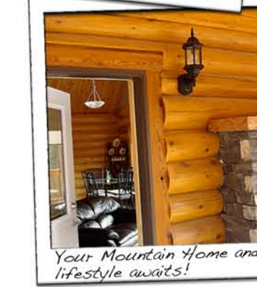
Your Mountain Home and lifestyle awaits!

TWO luxurious fully furnished and completely self-contained Cedar Log Chalets presently utilized for daily/weekly upscale rentals. Each Chalet accommodates up to 10 people comfortably.