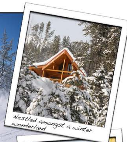
Nestled amongst a winter wonderland

All Season Adventure at Panorama Mountain Village